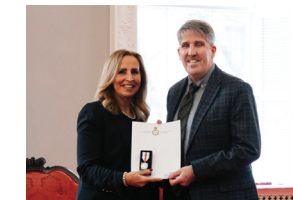
Luke MacDonald Health Care