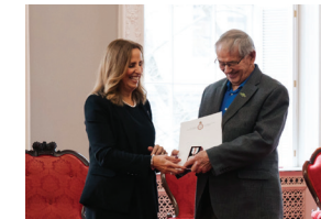
Murray Elliott Volunteer Services